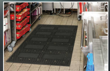
Traction Tread Grit