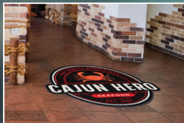
ColorStar® Impressions HD Custom Shape